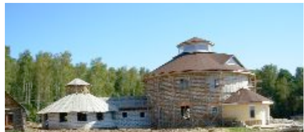
the Education Centre & dining hall