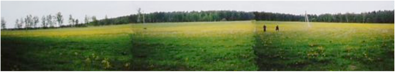
Spring 2004 An empty field. The land was bought and the organisation was registered