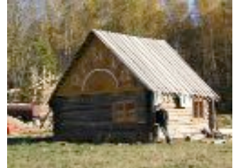
Summer 2004 the youngsters built the first house